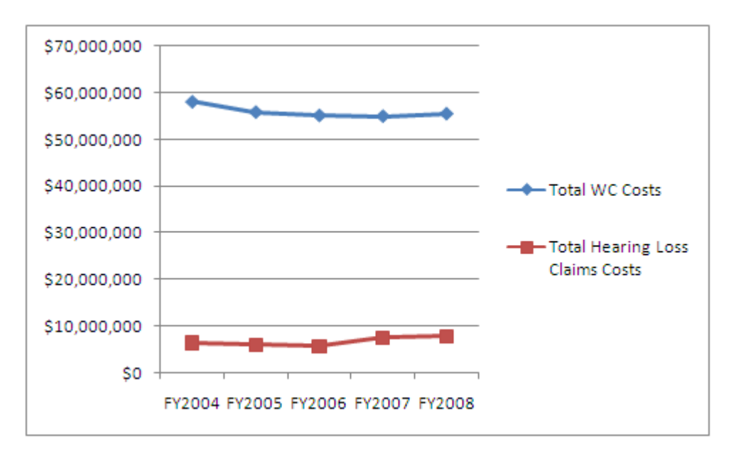
Figure 1: Total WC Costs Compared to Hearing Loss Costs

Included in TVA's total costs of WC charges per year are hearing loss claims. During our review, concerns were raised about the amount spent on hearing loss. Hearing loss claims are filed when an employee believes his/her hearing has been adversely affected by their employment at TVA. As seen in Figure 1 below, the costs of hearing loss claims represent a significant portion of TVA's total WC costs.