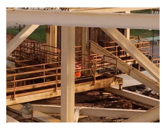
Illustration 3 Corroded Grating Near Flue Gas Ductwork, Cumberland Fossil Plant, January 2016

<u>Compromised Grating</u>: Grating is an industrial flooring material made of metal. As such, it is susceptible to acidic compounds that can leak from ductwork, corroding the surface, as shown in Illustration 3. Corrosion may compromise structural integrity of the grating.