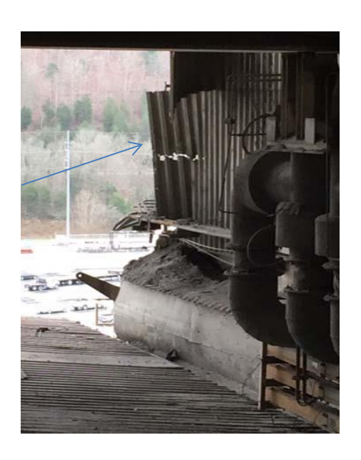
Illustration 1 Loose Lagging on SCR Box, Bull Run Fossil Plant, December 2015

• Flue Gas Exposure: (See Illustration 2.) Flue gas is comprised of SO<sub>2</sub>, NO<sub>x</sub>, and ash particles, which are subject to OSHA regulations for toxic and hazardous substances in the workplace. Applicable OSHA standards for SO<sub>2</sub>, NO<sub>x</sub>, and ash particle levels are set for 8 hours of exposure and are to be measured by taking samples from impacted areas. According to OSHA, if air contaminated with harmful dust and gases cannot be controlled by engineering controls, appropriate respirators shall be used.