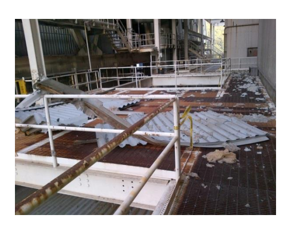
Illustration 4 Fallen Lagging on a Grated Walkway, Bull Run Fossil Plant

In addition, TVA's Safety Manual indicates every employee is responsible for knowing the hazards associated with his or her job and reporting each injury and near-miss accident. We reviewed documented recordable injuries and near misses and found no documented recordable injuries or near misses resulting from ductwork. However, we were provided examples of near misses at Bull Run that were not recorded, possibly due to an employee's fear of reprimand. An example of an unrecorded near miss due to fallen lagging at Bull Run is shown in Illustration 4.